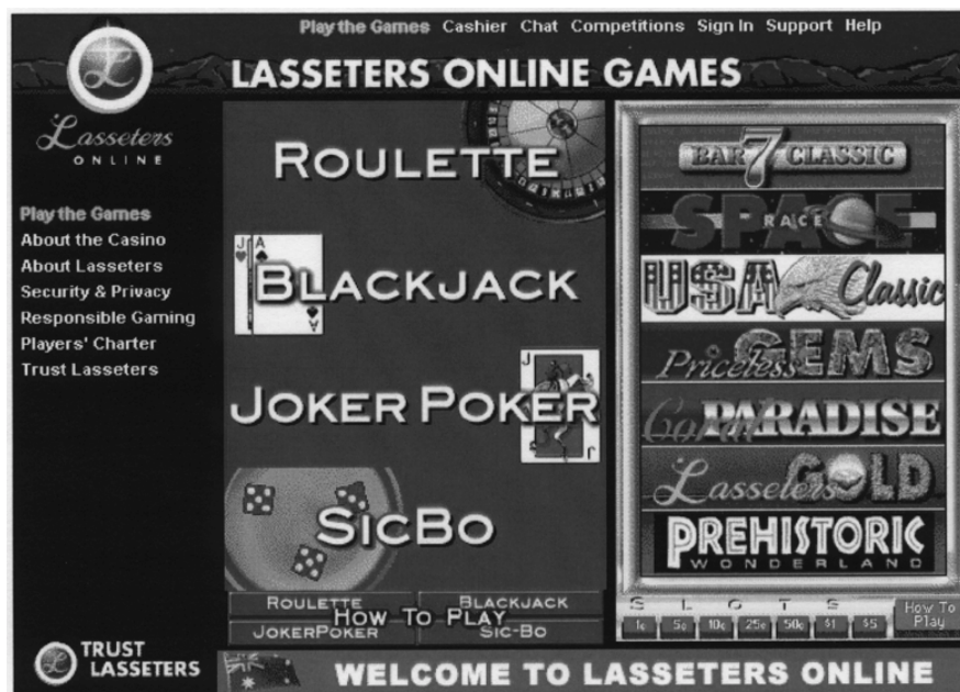
Screen 1 contains a link 'Responsible Gaming'

3.89 Lasseters Online currently includes a link to problem gambling Internet sites. This facility is not explicitly required by Queensland and Northern Territory legislation that regulates online gaming. None of the regulatory models for interactive wagering in Australia stipulate this type of facility either. The Lasseters Online graphics are presented below in the order in which they can be accessed.